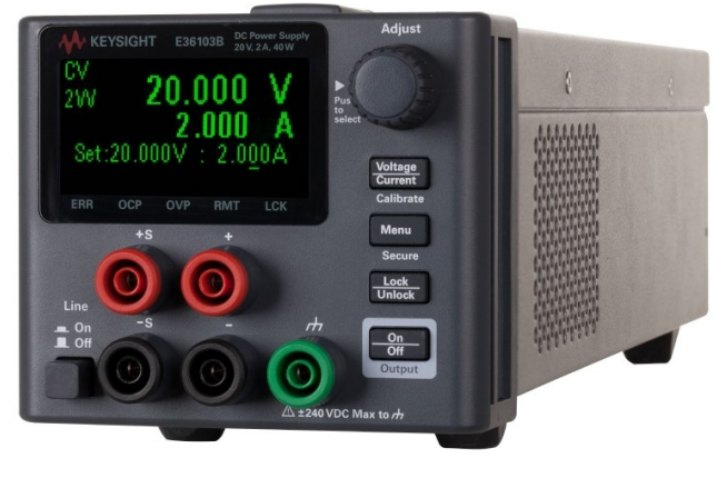
Option J01 recessed binding posts

Do you need to convert the power supply for different mains power? The two switches on the bottom of the instrument make it straightforward. See the product manual for details.